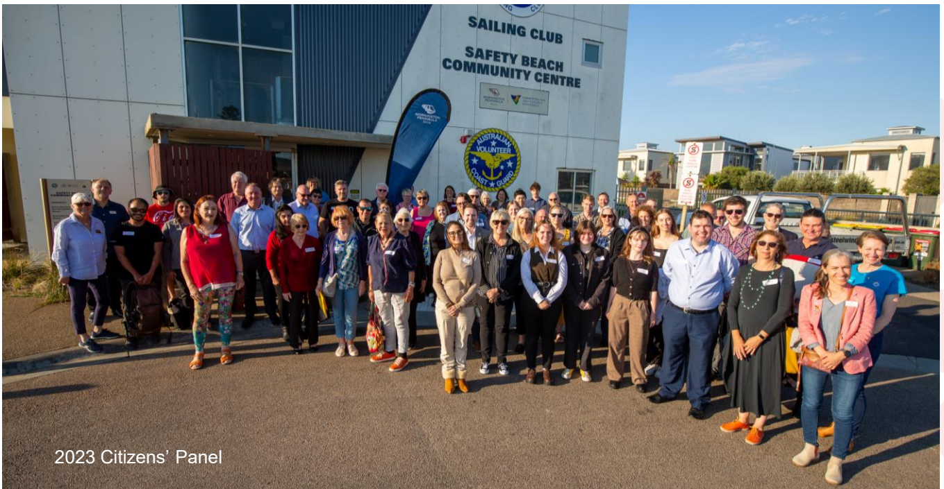
2023 Citizens' Panel